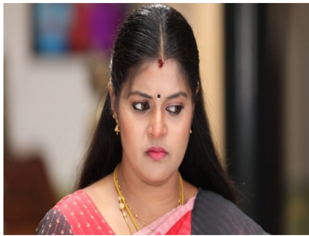
Twilight Render 1.4.5 Serial